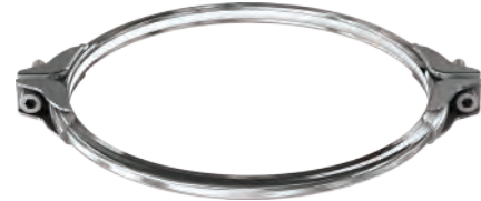
Bolted pull ring with inserted seal.

Application: Bulk goods in the chemical and food area, industrial dust extraction systems, low pressure conveying, air supply. U-shaped gaskets available in NBR and silicone (food grade), EPDM (conductive) or Viton.