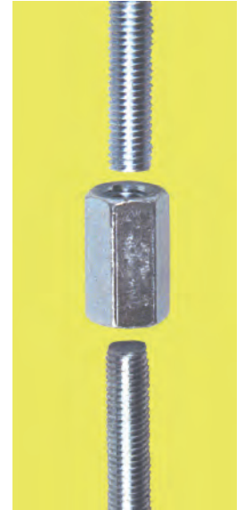
Extended Hex Nut Connects Threaded Rods For Variable Heights.