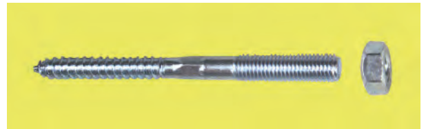
Anchor Screw and Hex Nut Securely Fastens To Walls and Floors