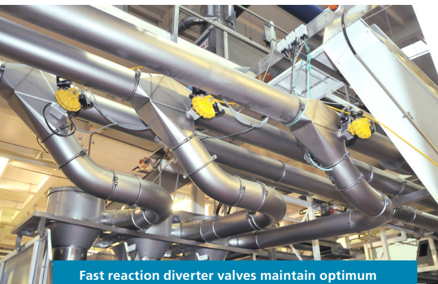
Fast reaction diverter valves maintain optimum capacity at the packing heads.