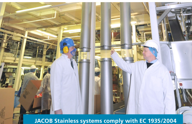
JACOB Stainless systems comply with EC 1935/2004 plus FDA sanitary standards.