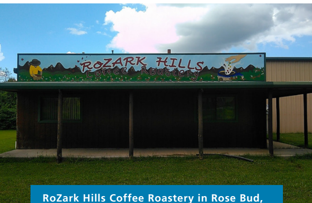
RoZark Hills Coffee Roastery in Rose Bud, Arkansas