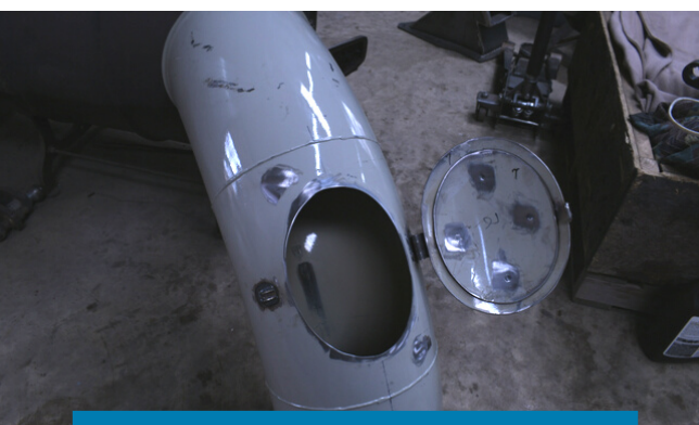
Artisan Coffee Group customized Jacob Tubing Elbow.

Artisan Coffee Group recommends Jacob Tubing systems to all of their customers and prospects. They are confident in Jacob Tubing's products and especially emphasize the ease of cleaning and maintaining the roaster with the use of the Quick Connect Clamps. Artisan Coffee Group even customizes Jacob's elbows by fabricating an access opening for cleaning, which removes the need to disassemble the tubing. With the expertise and decades of experience that Artisan Coffee Group has with maintaining, building and installing coffee roasters, the trust they have for our products with their customers emphasizes the reliability of Jacob Tubing Systems. Artisan Coffee Group is a Veteran Owned and Operated company. They offer unparalleled experience with Roaster Rebuilds, Roasting Plant Design & Install, Mechanical & Roasting Issues, UL Listed Controls, Destoners, Grinders, Green Loaders & Bucket Elevators, Scales, Conveyors, Plant Air Design, Product Handling and Product Movement.