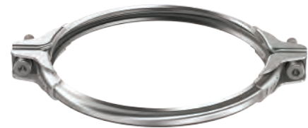
Bolted pull-rings for slip tubes 1 – 3 mm wall thickness used with ring seals