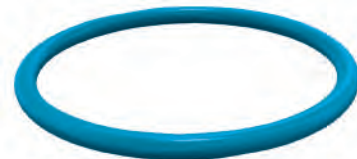
Ring seal for assembly of slip tubes