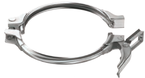
Quick Connect® pull-rings for slip tubes 1 – 2 mm wall thickness used with ring seals